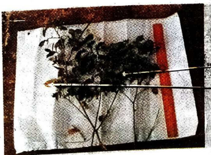
Plate 1. Detached shoot of Cassia tora showing chlorotic leaves in relation to normal Leaves