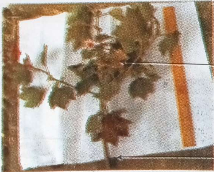
Plate 3 Detached shoot of Urena lobata showing necrotic leaves in relation to normal leaves.