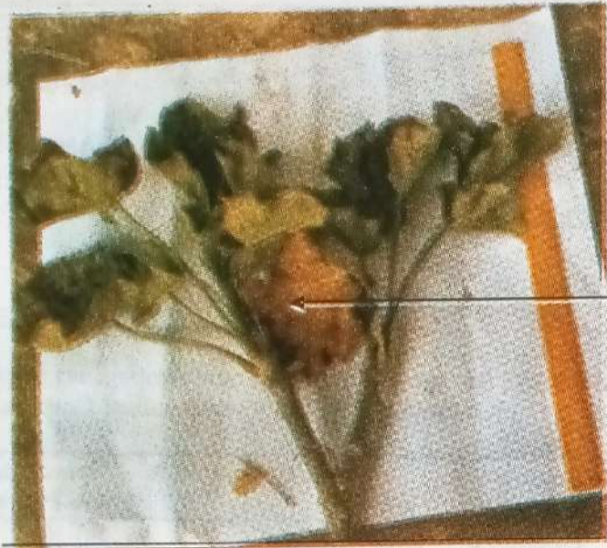
Plate 2 Detached shoot of Jatropha curcas showing necrotic leaf in relation to normal leaves