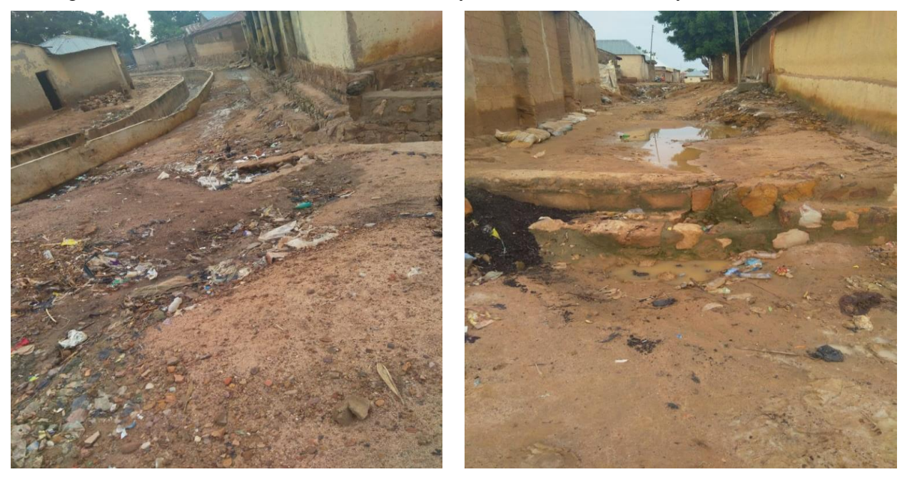
Plate 5 and 6: Poor drainage system

Lastly, lack of proper drainages with 9% of the respondents supporting this. Though it is the least among the causes of flooding in the area, some respondents believed that if there were good drainages, flood incidence would have reduced by about 75% in the study area.