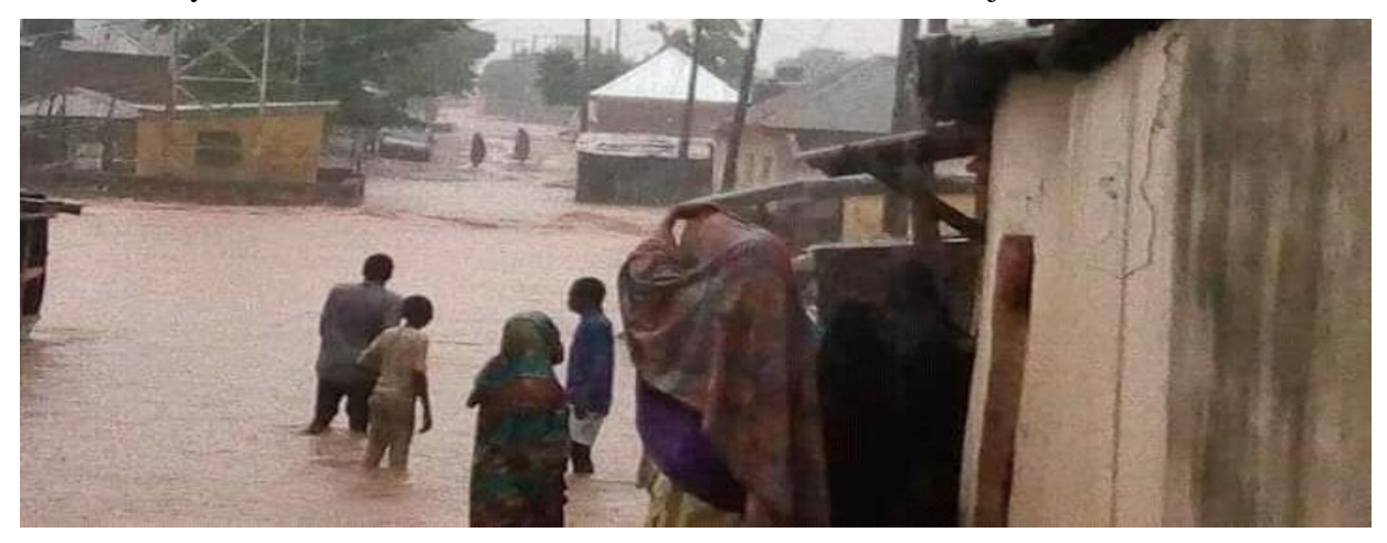
Plate 1: Flooding as a result of heavy rainfall at Tudun Wada

From Table 2, heavy rain fall is ranked the number one factor that is responsible for flood incidence in Gombe metropolis, where 52% of the respondents attributed the reason of flooding in the study area to heavy rain fall which leads to the overflow of rivers to the adjacent land.