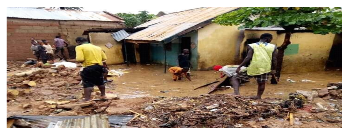
Plate 7: A house filled-up with water and collapsed at Jekadafari