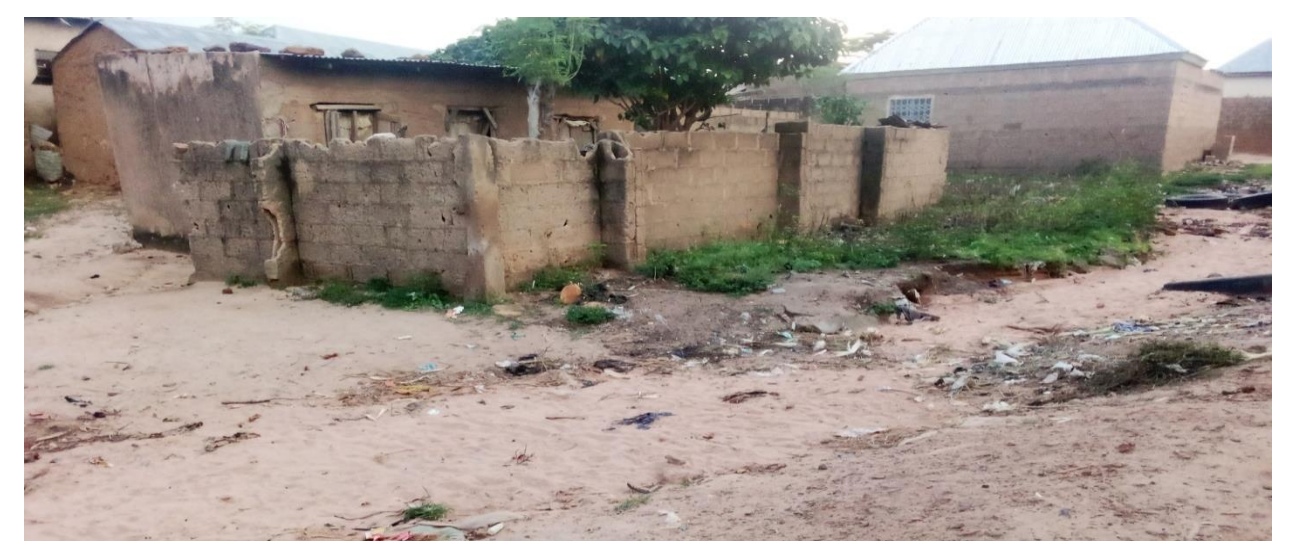
Plate 4: Houses build on waterways

However, the sporadic urban development (lack of good layout plan) rank the third driving factor for flooding in the study area where 15% of the respondents claimed that flooding incidence usually occur in the area that do not have well planned layout as in Plate 4.